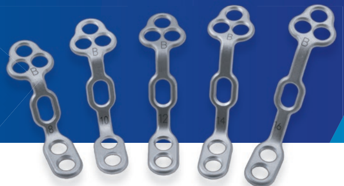
Plate with hook