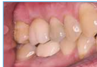
6. Final aesthetic result.

Individual results may vary. 1 Data on file with Collagen Matrix, Inc.