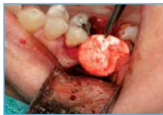
2. Membrane being prepared for placement.