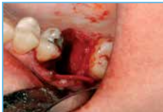
4. Membrane placed in socket.