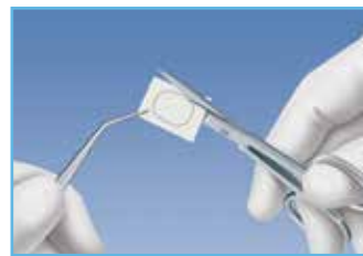
3. Membrane cut for placement.