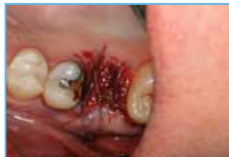
5. Sutures placed to close site.