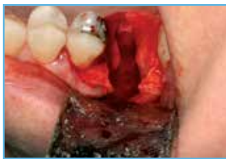
1. Exposed buccal wall defect on #3.